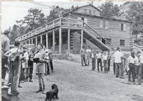
Boy Scouts at Camp Alexander in 1948.

Construction of the Colorado Midland Railway started in 1886 and ultimately spanned 261 miles between Colorado Springs and New Castle. The winding section through “Granite Canyon” was completed by April 1887. For thirty-two years the Midland hauled coal, livestock, hay, wool, lumber, produce, other goods, and passengers, before ending service in 1918. It is thought to be the largest abandoned rail project in the world.