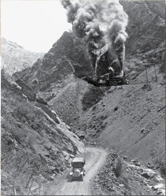
Colorado Midland Railway and Old Car in "Granite Canyon." Image 001-732.