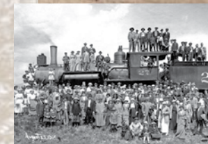
The Rock of Ages (above) is now Idlewild Picnic Ground. Wildflower excursion at Idlewild Park in 1914. Image 001-4135

5 A railroad station at Idlewild had several buildings, stock pens, and a telegraph device. This was a favorite stop for Colorado Midland wildflower excursions from Colorado Springs. Located in Idlewild Park, the Rock of Ages is a well-known landmark near the end of Elevenmile Canyon Road.