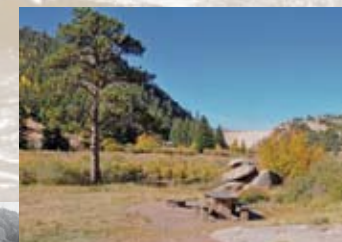
Reservoir Campground first opened in the 1930s. The name was changed to Spillway Campground (at left) in the 1970s.

5 A railroad station at Idlewild had several buildings, stock pens, and a telegraph device. This was a favorite stop for Colorado Midland wildflower excursions from Colorado Springs. Located in Idlewild Park, the Rock of Ages is a well-known landmark near the end of Elevenmile Canyon Road.