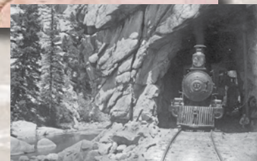
Tunnel 9 (ca. 1890). Denver Public Library, Western History collection, Wm Henry Jackson. WHJ-748.

4 Locomotive smoke residue is still visible in and around three different Colorado Midland tunnels . Here it’s easy to imagine locomotives billowing smoke as they chugged through the canyon.