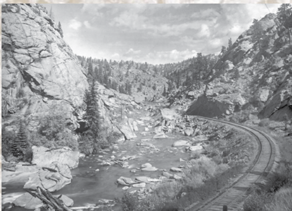
Granite Canyon and Midland Railway (ca. 1890).