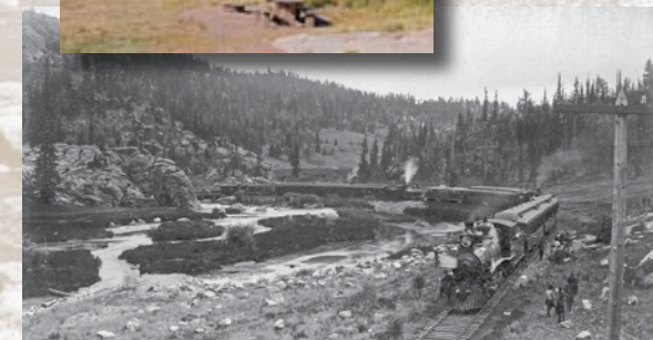
Colorado Midland Picnic Grounds in Granite Canyon (ca 1885). Denver Public Library, Western History Collection, Wm Henry Jackson. WHJ-130.

6 From Spillway Campground , Eleven Mile Dam can be seen in the distance. Built in 1932, Eleven Mile Reservoir stores up to 97,000 acre feet of water for the city of Denver.