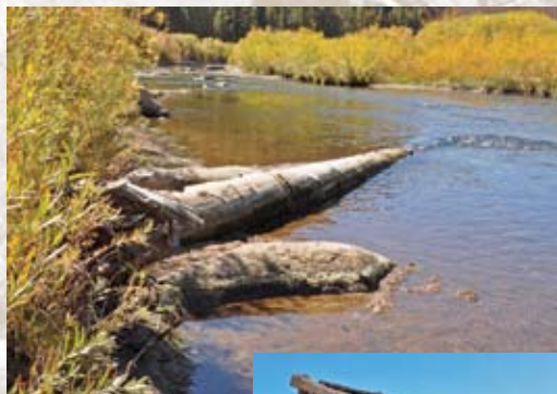
Trees for Trout river enhancements (above) and the Lidderdale site (right).

In 2004 the Trees for Trout Program placed dead ponderosa pines from the Hayman Fire area to increase trout habitat near the Lidderdale site. Here, partially submerged trees along a thousand feet of river benefit fish and anglers alike.