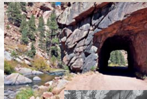
Tunnel 9 is one of three Midland Railroad tunnels encountered in “Granite” (now Elevenmile) Canyon.

3 About 2.8 miles into the canyon, Elevenmile Dome (above) is one of many named granite outcrops. Others include Arch Rock, Turret Dome, Rock of Ages and the Fortress, to name a few. Nearly 100 different routes have been established here since rock climbing began in earnest during the 1960s.